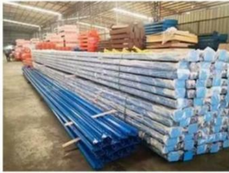
Package for Upright Frame