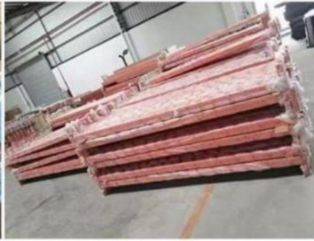
Package for Beam