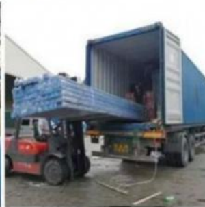
Loading for Wire Mesh Cage