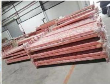
Package for Beam