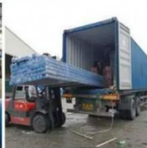
Loading for Wire Mesh Cage