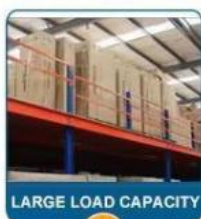
LARGE LOAD CAPACITY