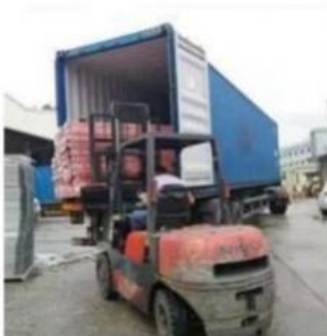
Loading for Beam