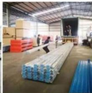
Loading for Upright Frame