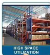
HIGH SPACE UTILIZATION